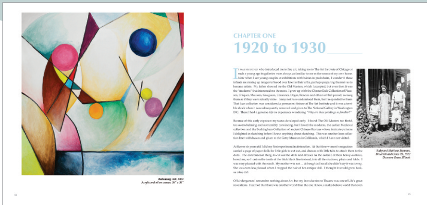
Example of a double-page spread.