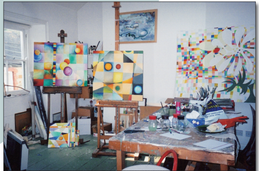
The artist's studio, Flushing