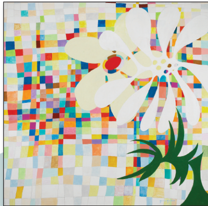
Big Happy, 1995, Acrylic on board, 48" x 48"