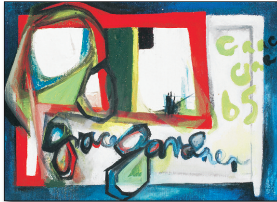
Grace Gardner, 1965, Acrylic and oil on canvas, 10" x 14"